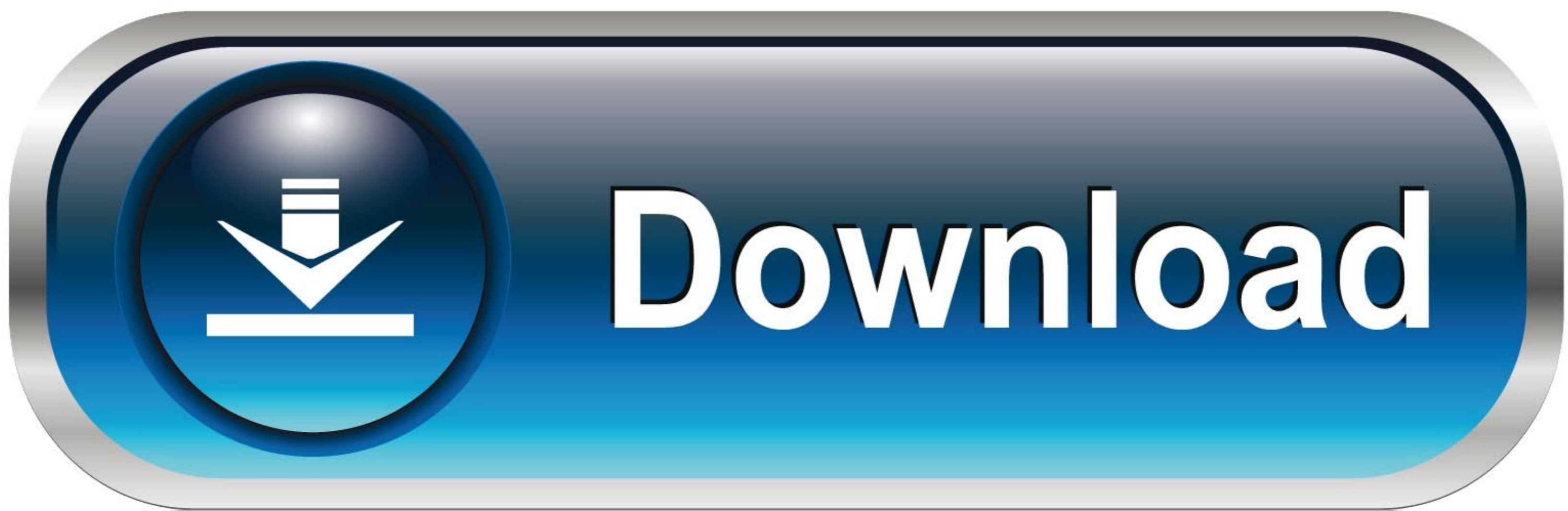
Guitar Pro 6 Activation Key Offline